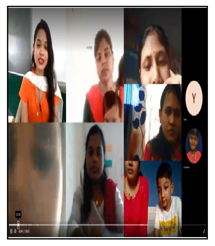
PTM: Online PTM conducted for the classes I to VII and Offline for the classes IX to XII on 09 Oct 2021.